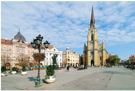
Figure 1 Novi Sad City Square

Novi Sad is the capital of Vojvodina, the Northernmost part of Serbia. It has about 300,000 inhabitants. It is located on the Danube river. On the Southern side of the Danube, which flows roughly from West towards the East near the city, lie the Fruška gora mountains and the Petrovaradin (Pétervárad) fortress built in the 17 th century.