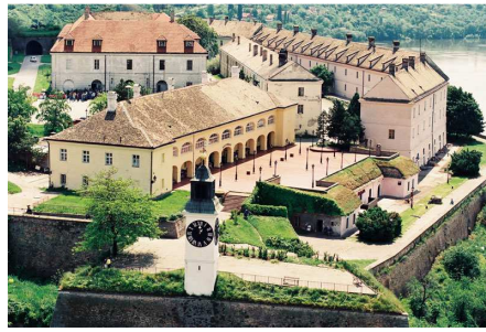
Figure 2 Petrovaradin Fortress

The largest state funded higher education institution in the city is the University of Novi Sad ( www.uns.ac.rs ), with over 50,000 students and 5,000 employees.